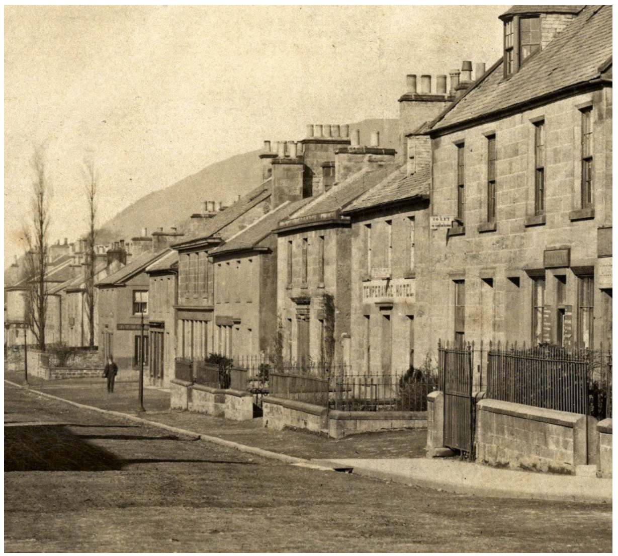
A temperance hotel on Bridge Street, Dollar<sup>81</sup>

premises were originally built as a temperance hotel in the early 1890s.<sup>79</sup> There was a teetotal curling rink in the town, formed in 1855.<sup>80</sup>