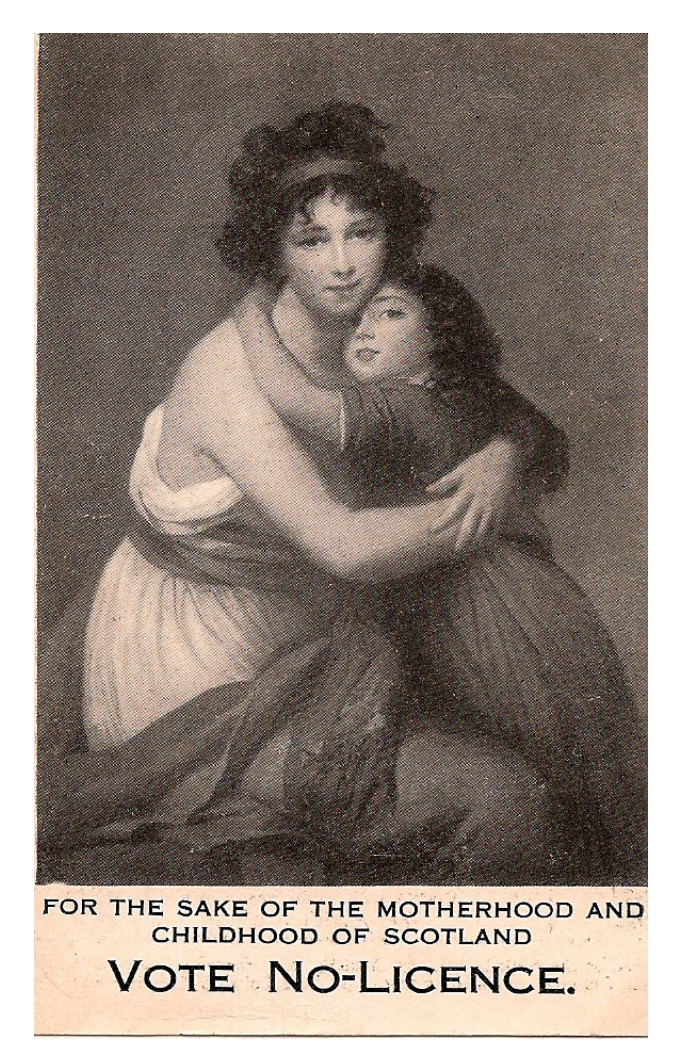
Temperance propaganda advocating a 'No licence' vote<sup>13</sup>

These arguments rumbled on for decades. Temperance activity in Scotland peaked with the 1913 Licensing (Scotland) Act. This piece of legislation allowed polls of the electorate to be taken at the town or burgh level to determine if there was enough support for local prohibition or limitation of licences. Implementation of the Act was delayed by World War I, during which the Defence of the Realm Act severely restricted pub opening hours. The first series of polls took place in 1920. They were not truly democratic because most working class men and women did not have the right to vote in local elections. The Act specified that a poll could be taken only if 10 per cent of the electorate requested it and a 55% majority was required to bring about a 'No Licence' outcome. They did not receive the level of support hoped for by the temperance movement. Only 41 towns in Scotland voted for No Licence (banning alcohol), and 35 for Limitation (restricted licensing) at the first polls. Among the towns 'going dry' were Kilsyth, Kirkintilloch and Wick. In contrast 508 towns voted for no change.<sup>12</sup> Polls were periodically taken in subsequent years but the idea did not gain ground.