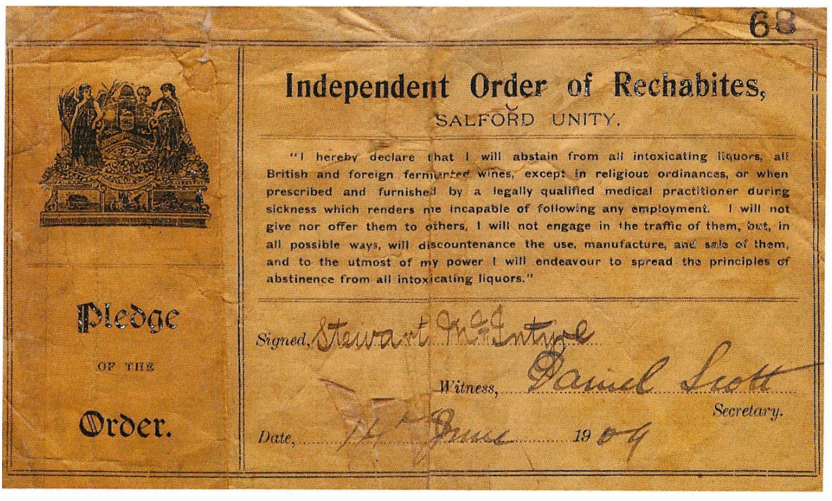
A Rechabites pledge card from 190967

The Independent Order of Rechabites was a type of friendly society which offered sick and funeral payments for members in return for regular contributions. Rechabite societies, or 'tents' as they were called, are known to have existed in the Hillfoots. One was formed in Dollar as early as February 1841.<sup>65</sup> The Alva society had a juvenile tent, 'Hope of the Ochils', with over 60 members in 1902.<sup>66</sup>